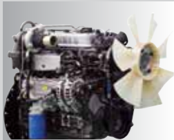
HMC D4DD engine