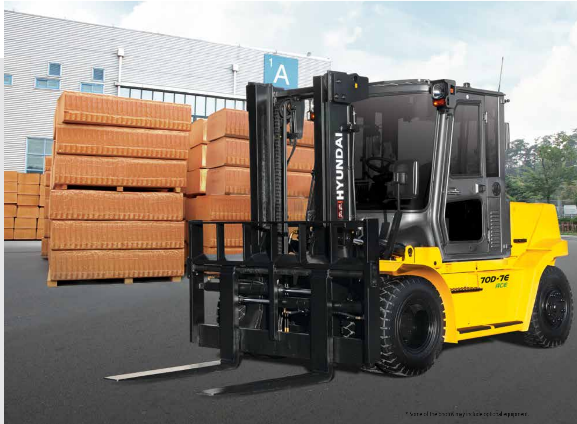
* Some of the photos may include optional equipment.

Full-automatic transmission gives easy, convenient handling and soft, smooth shifting. The operator can select two kinds of automatic mode.