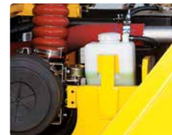
Easy-to-access reservoir tank