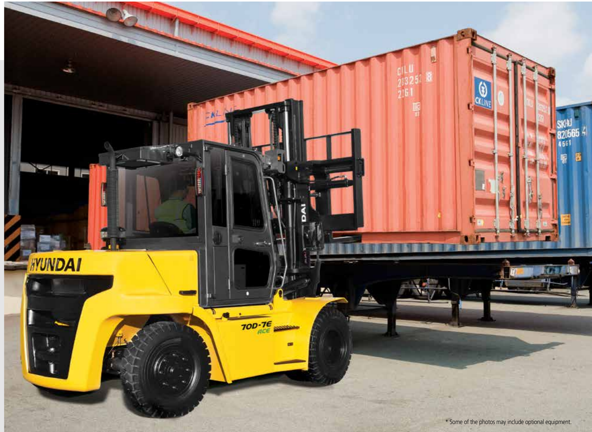
* Some of the photos may include optional equipment.

The latest large-capacity hydraulic system reacts quickly during operation, and a low-noise control valve increases both efficiency and durability.