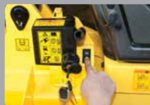
Cabin tilting automatic system Cabin tilting automatic system makes servicing of all power train components quick and easy. An electrically assisted hydraulic actuated cylinder tilts operator cabin to left side about 54 degrees for easy access to inside of truck components.