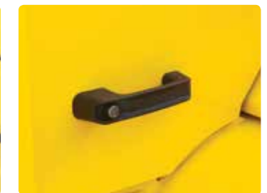
Wing cover locking system