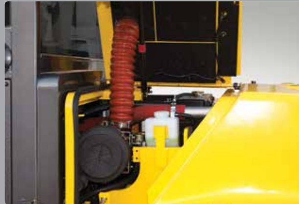
Large engine hood Highly accessible engine compartment assures fast and efficient maintenance.

An ideal arrangement of component parts ensures easy accesses and conveniences for the maintenance.