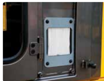
Cabin air fresh filter The internal pressure is maintained to be slightly higher than that of outside to exclude dust and to reduce noise levels.

* Some of the photos may include optional equipment.