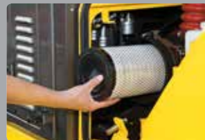
Easy change air cleaner The air filter is readily accessible for cleaning or replacement.