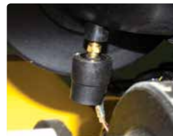
Electrically monitored air filter Air cleaner sensor alerts the operator of a clogged air filter and allows replacement before damage.