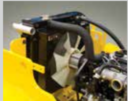
Up-to-date cooling system