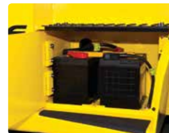
Maintenance free battery