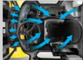
High-output air conditioner