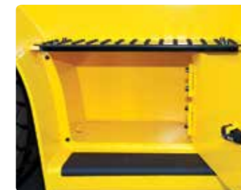
Large tool box Additional tool box located in machine side for operator's convenience.