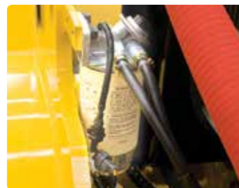
Mechanic friendly fuel filter replacement Highly accessible engine compartment allows for quick replacement of filters.