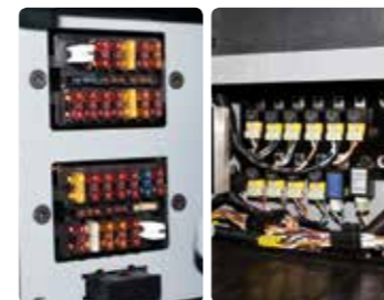
Compact fuse box for easy inspection