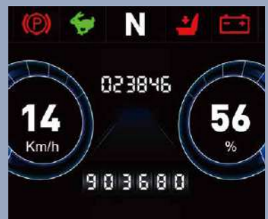
Multifunctional color screen instrument with graphical interface design is simple and intuitive for operator