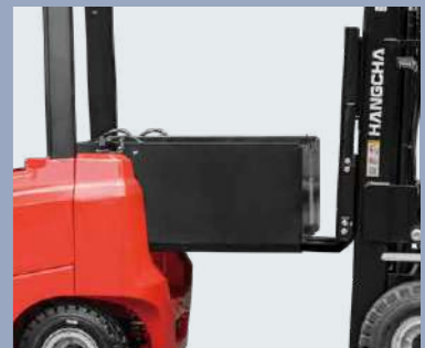
The battery can be removed from the rear enables the battery to be replaced more flexibly (Only for the lead-acid battery)