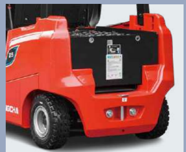
Battery is placed at the rear of the truck