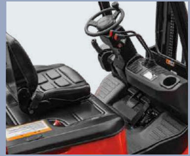
The truck is ergonomically designed to provide a good view and a large operating space