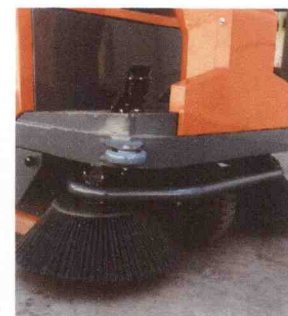
优质耐磨边刷,能够有效清扫大颗粒垃圾。 High quality wear-resistant edge brush can effectively clean large particles of garbage.