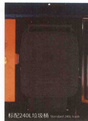
标配240L垃圾桶 Standard 240L trash

喷雾降尘, 防止二次污染。 Spray dust, prevent the two pollution.