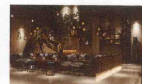
咖啡厅 coffee house