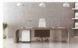
办公企业 Office business

Applied to the cleaning and maintenance of hard ground in the office enterprises, nursing organizations, malls, environmental protection institutes, kindergartens, schools, hospitals, etc., such as epoxy resin ground, cement ground, marble ground, polished tile ground, concrete ground and terrazzo flooring.