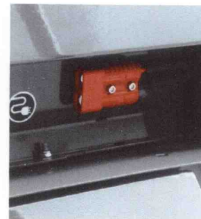
充电自主调整，充满电自动断电，自动修复。 Autoregulative charging ability, automatic power off when power full, automatic repair.