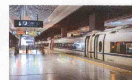
高铁站 High speed railway station