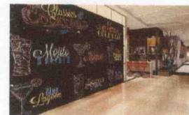
培训机构 Training institutions

Applicable to restaurants, hotels, cafes, offices, conference rooms and many other places can also be household, to meet different needs. Such as: epoxy resin floor, cement floor, marble floor, polished brick floor, concrete floor, terrazzo floor and other hard ground cleaning and maintenance.