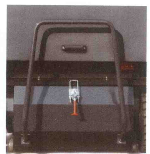
垃圾箱单扣链接机器，方便拆卸。 Garbage box single button link machine, easy to disassemble.