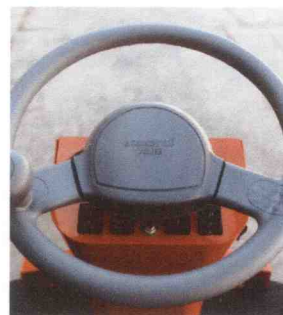
更简捷、更直观, 方便操作。 More simple, more intuitive, easy to operate.