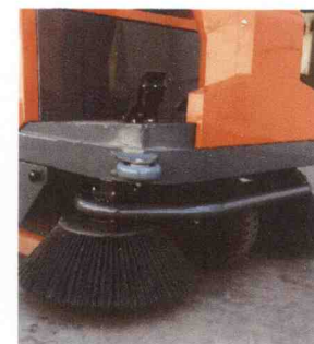
优质耐磨边刷, 能够有效清扫大颗粒垃圾。 High quality wear-resistant edge brush can effectively clean large particles of garbage.