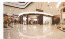
大型商场 Large shopping mall