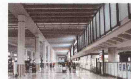
物流运输 Logistics transportation