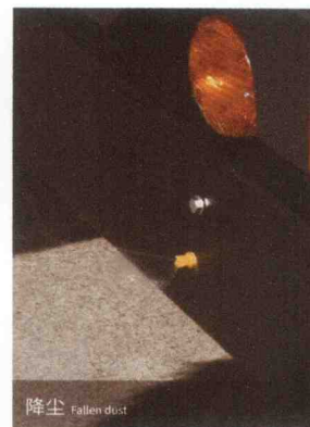
降尘 Fallen dust

轿车式设计, 可根据身高自行调节。 Car style design, according to the height of their own adjustment.