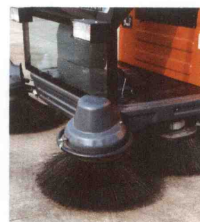
四刷设计, 能够有效清扫大颗粒垃圾。 Four brush design, can effectively clean large particles of garbage.