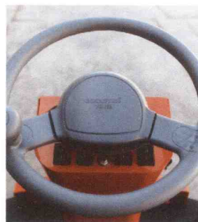
更简捷、更直观,方便操作。 More simple, more intuitive, easy to operate.