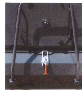
垃圾箱单扣连接机器,方便倾倒。 Garbage bin single connected with machine body, convenience to empty.