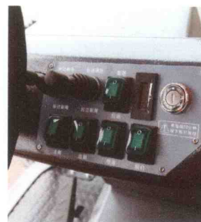
更简捷、更直观, 方便操作。 More simple, more intuitive, easy to operate.