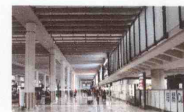
物流运输 Logistics transportation