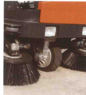
前轮采用特殊设计，防滑耐磨，使用寿命长。 Front wheel with special design, non slip wear, long life.