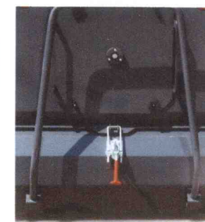
垃圾箱单扣链接机器, 方便倾倒。 Garbage single connected with machine body, convenience to empty.