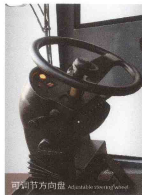
可调节方向盘 Adjustable steering wheel

轿车式设计, 可根据身高自行调节。 Car style design, according to the height of their own adjustment.