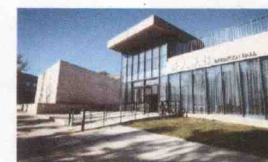
展馆 Exhibition hall