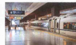
高铁站 High speed railway station