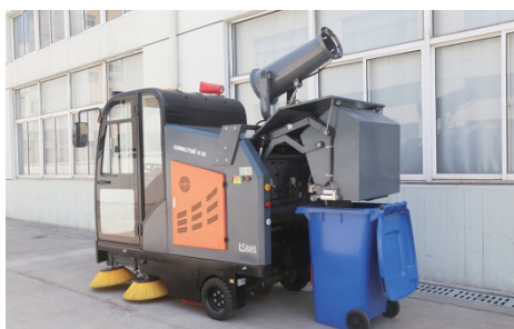
garbage dump truck