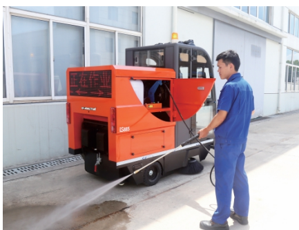
Optional high pressure flushing