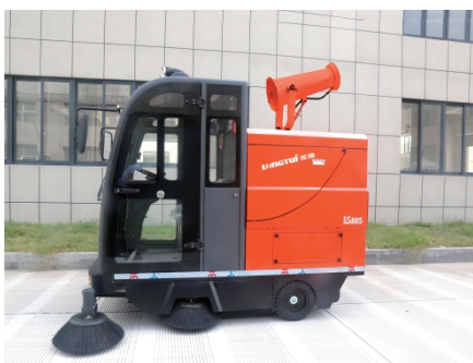
Optional fog cannon